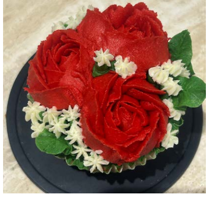
Roses and Blossom